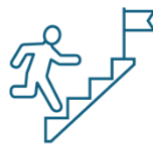
Invest in People